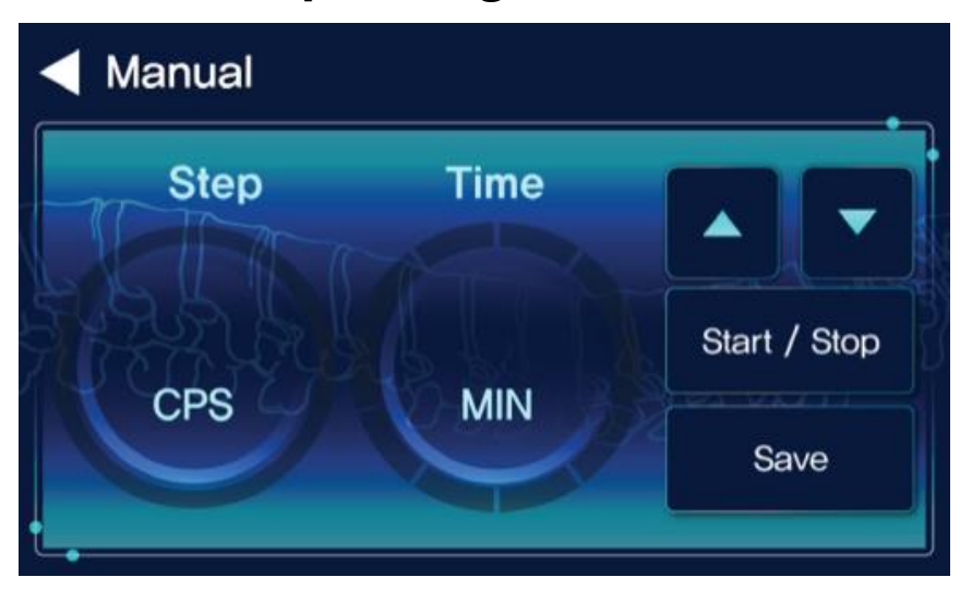
Adjust intensity and time by both screen or dial