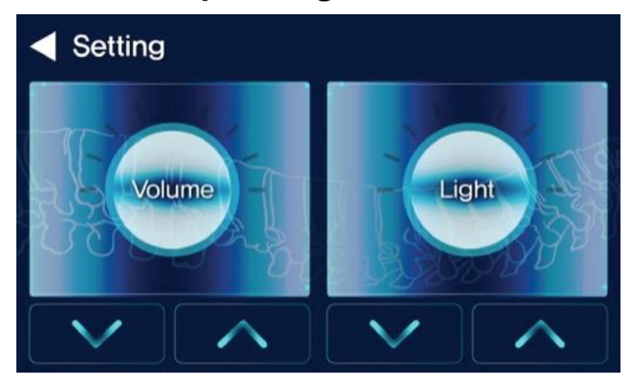
Volume and brightness adjustment (9 level for both)