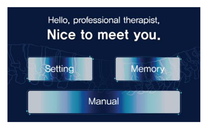
Start your treatment