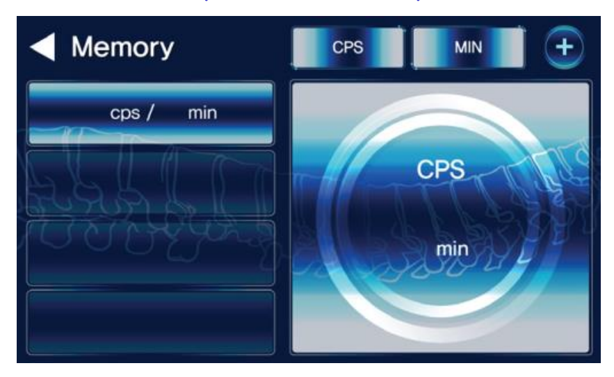
Memory Function (you can save up to 4)