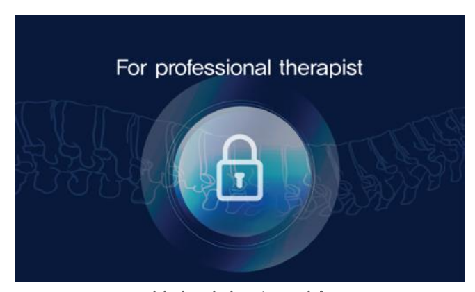
Unlock by touching